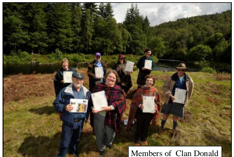
Members of Clan Donald on their plots of land at the Dog Pool.

Over 40 people attended including 8 members of Clan Donald USA, representatives of the local outdoors community, residents from Invergarry and plot owners from elsewhere in the UK.